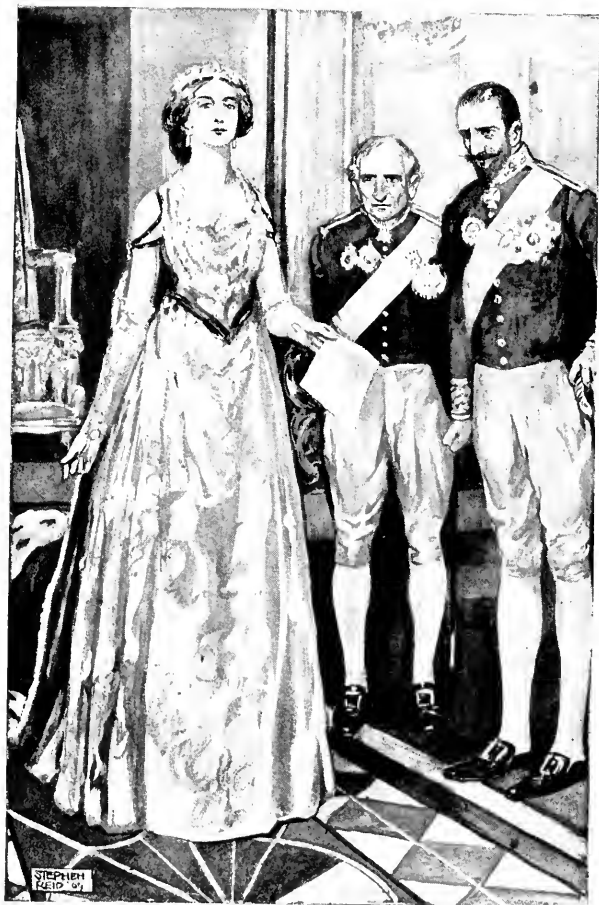
The princess swept by him with an air of ineffable disdain.